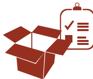
Shipping Bump Bar